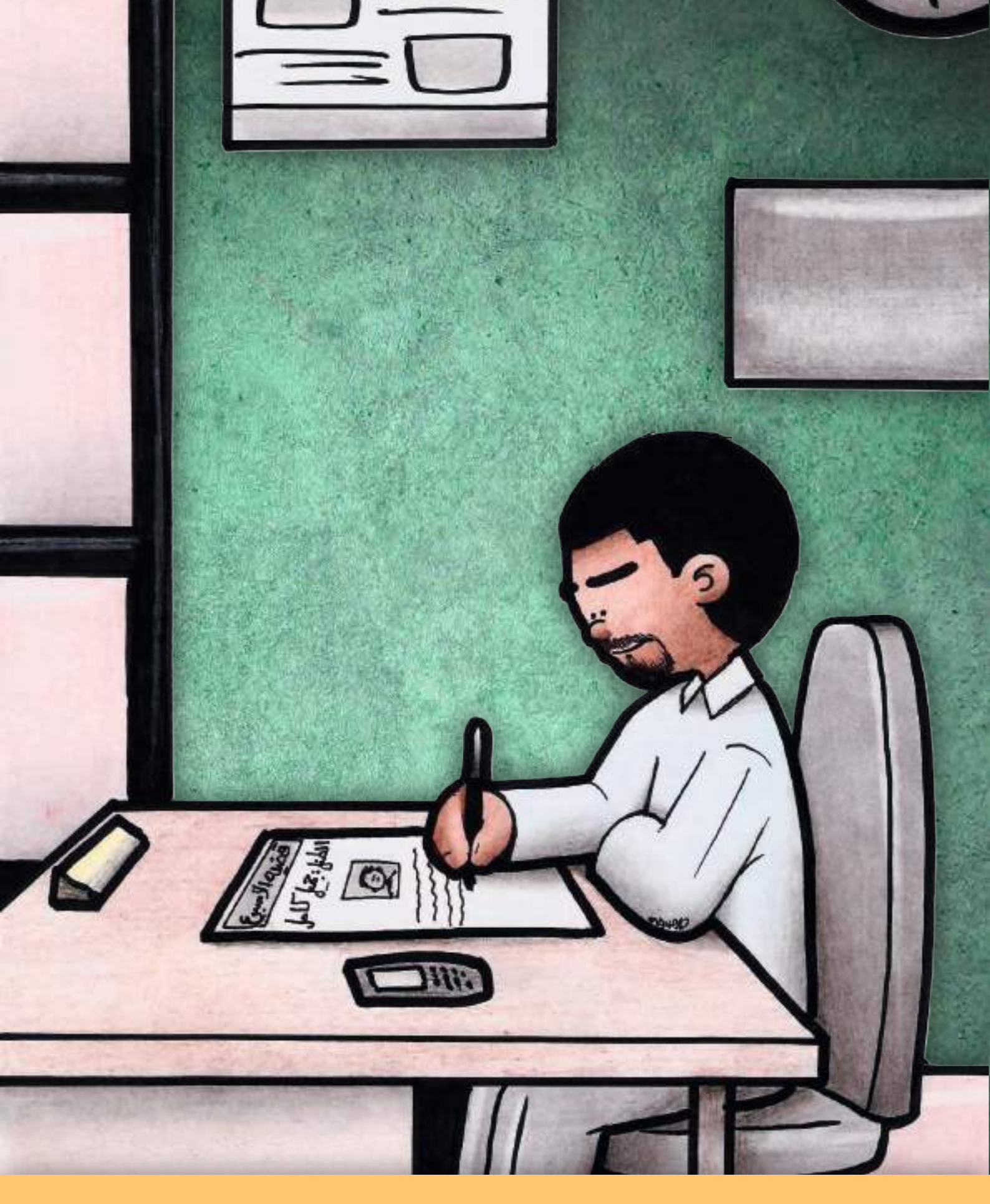
My life is not a news material;