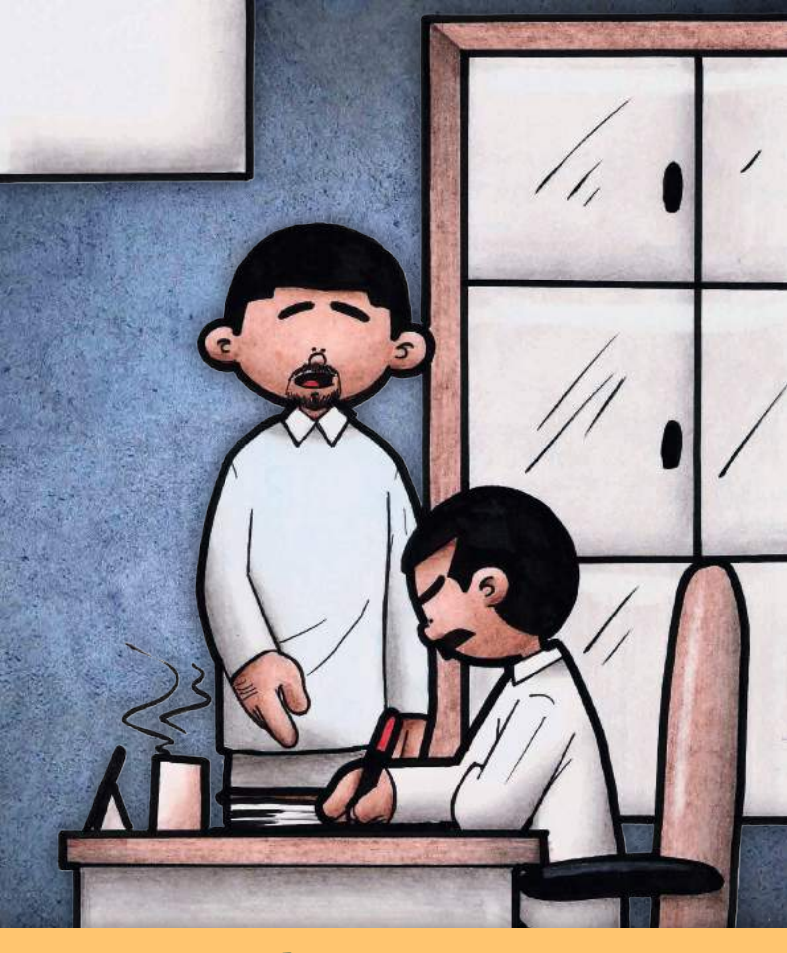
Respect my privacy;